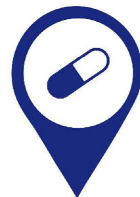
SUPPLEMENTS + VITAMINS